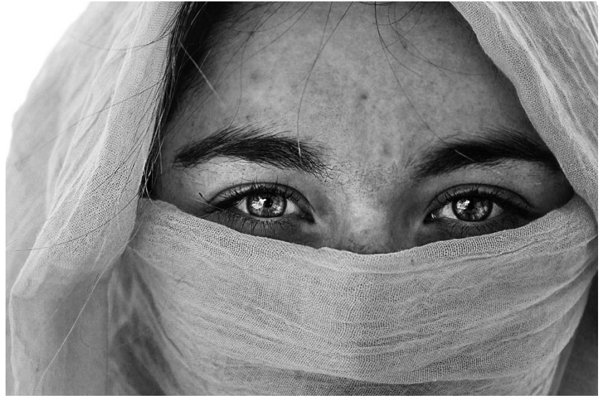
...IN THE SILENCE OF THE LITTLE ONES