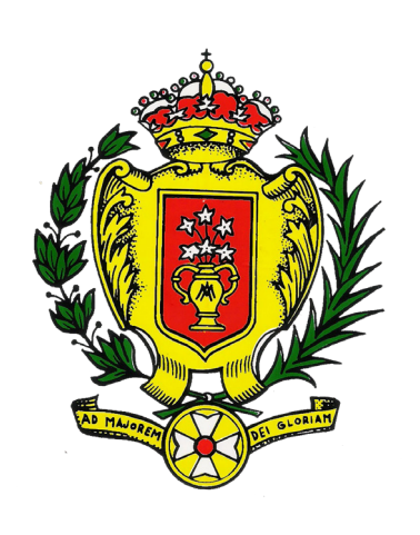
Sisters of Charity of Santa Ana